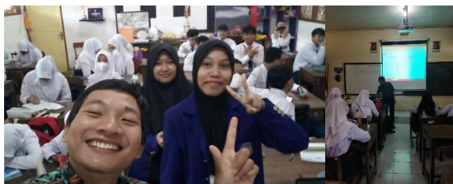
Fig 3. Implementation of Learning Management System Pinter Pancasila

(5) The media program evaluation stag, This stage is the final stage of media development, namely revising the learning media, before the dissemination process or spreading the learning media so that it can be used by the public.