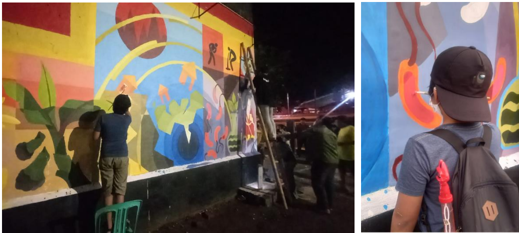
Fig. 9. Art Activity: Making a Mural in Jamblang, Cirebon