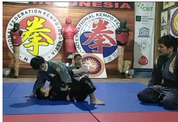
Fig. 5. Self-Defense Activities

Another positive value obtained through online learning is quite a lot of free time. That's what made the writer take part in self-defense activities, namely Jujitsu. In addition to gaining knowledge of self-defense, it is also felt that there is a lot to learn about strategies for dealing with problems. Many rules are also studied such as various techniques or moves, these things help the writer to control himself. Apart from Jujitsu, self-defense using a katana or sword is also practiced. Self-defense indirectly can increase creativity, this statement is in accordance with one type of learning, namely problem-based learning, whose goal is to solve a problem and discover new things. Creativity is an ability possessed by a person in the form of ideas and actions in an effort to solve the problems found (Nazareta, 2016). In addition to creativity, martial arts help build self-confidence and provide motivation regarding health such as choosing healthy foods to improve body performance, besides that it also increases focus (Diandra, 2020).