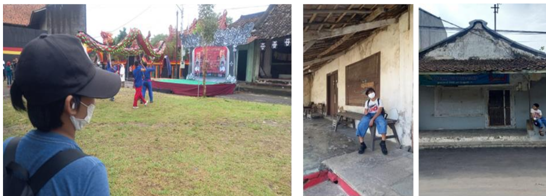
Fig. 6. Experiencing the Culture Firsthand at the Location: Lion Dance Show (left) & Peranakan House Building (right)

Online learning activities can be done anywhere and anytime. So, students and parents have no worries about traveling anywhere but can still participate in school learning activities. Of course, this situation can enrich the material provided at school because it can be directly experienced at the locations visited. The knowledge gained is not only through books or tutor presentations but can be obtained directly with direct experience. An example is a knowledge about culture, one of which is Chinese culture through the Jamblang Festival. Jamblang is known as Chinese Village or Chinatown in Cirebon, West Java. The author went to the event and immediately saw the influence of local culture and Chinese culture on the Barongsai dance, and also saw the influence of Chinese culture on the various old buildings called Peranakan Houses that were there (figure 6).