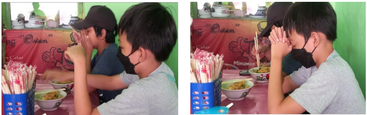
Fig. 3. Practice Religious Tolerance Outside School Activities: Pray before Meals