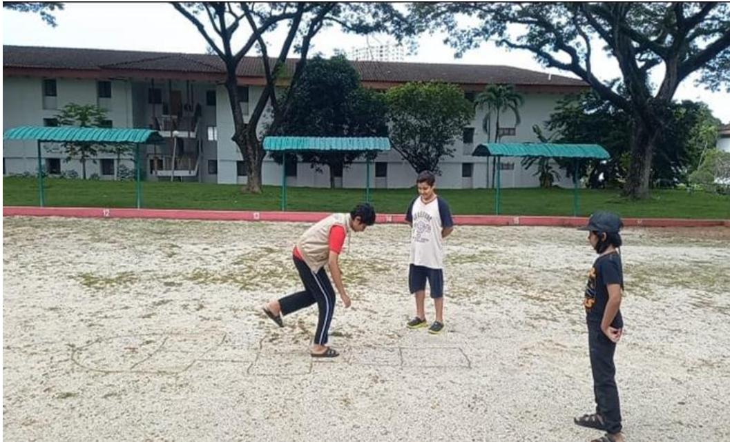
Fig. 8. Introducing Indonesian Traditional Games to International Friends

The various activities carried out above, not only have practical value or more to hard skill and soft skill training, training that requires manual or technological skills but also have educational value. This statement contradicts research conducted by Lukmana (2021) which says that online learning has weaknesses because it is more towards training than education. In addition, the statement regarding the enthusiasm and interest in student learning, that when students encounter difficulties in learning, they easily feel hopeless and fail in learning is not proven based on the author's learning experience. However, please note that the role of parents is also very large in online learning. If a failure in learning occurs, parents need to calm down and continue to provide enthusiasm for learning because students do not get direct support from their classmates or teachers.