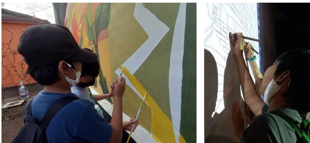
Fig. 4. Making a Mural with New Friends