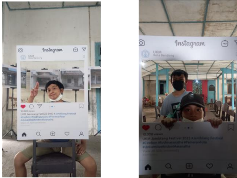
Fig. 2. Meet and Play with new friends at the parents' research location