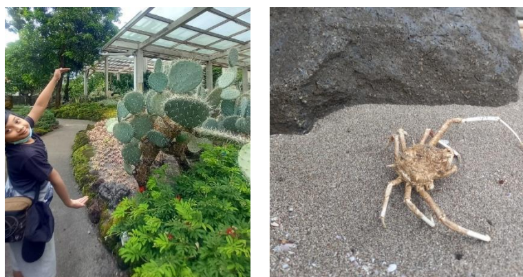
Fig. 11. Learn Natural Science Hands-on: Large Cactus Plants (left) & Sea Animals (right)