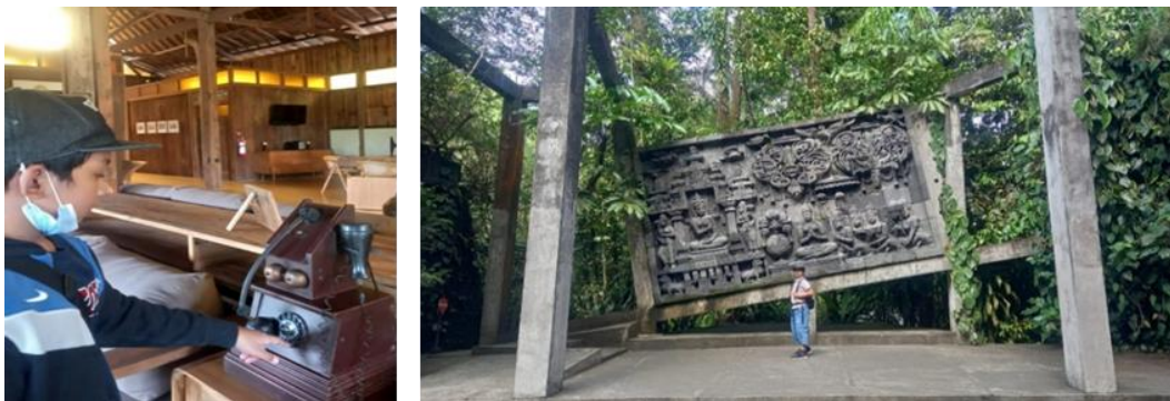
Fig. 7. Old Telephone at Alam Manis Village & Learn Ancient Batik at Ulen Sentalu Museum

These memories and experiences cannot be felt when participating in face-to-face learning, because they are limited by time and place.