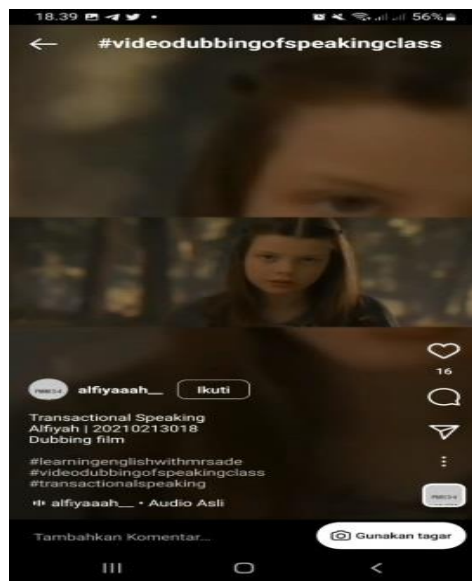
Fig. 4. Instagram post of alfiyaaah

"I'm looking for a suitable film, then I study the dialogue and then practice pronouncing according to the film I will be dubbing, recording, editing and uploading on Instagram".