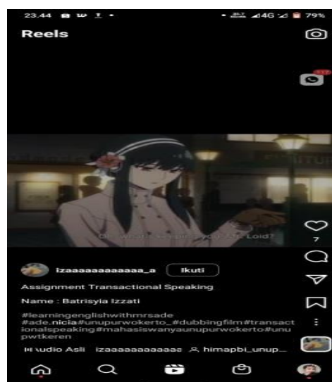
Fig. 3. instagram post of izaaaaaaaaa_a