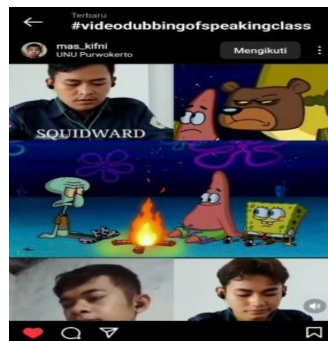
Fig. 2. Instagram Post of Mas_kifni